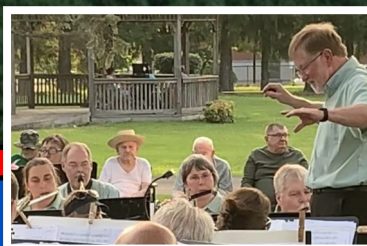
Eagles Concert Band