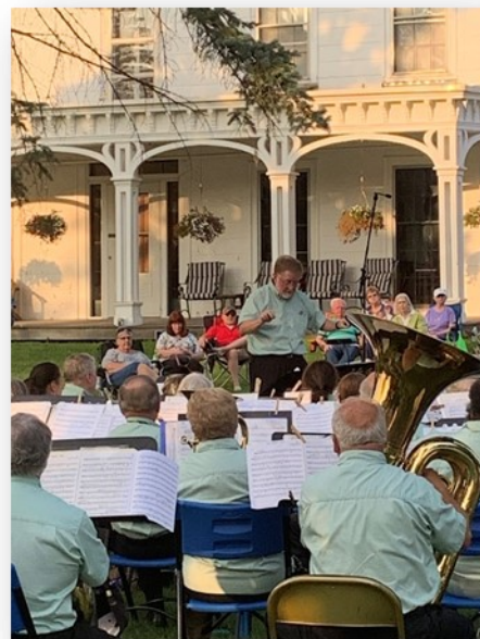
Concert on the lawn