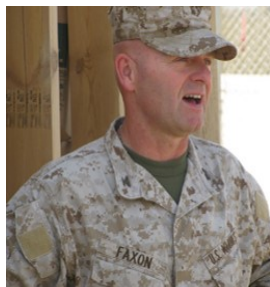
Semper Fi" AF

Therefore.....for all of us living, working, or visiting the Vermont Veterans' Home.....I thank you!