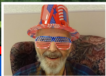
4th of July