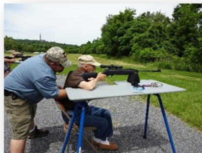
The VVH Range is busy!

Vermont Veterans' Home family and team, it continues to be a busy summer!....Picnics, car shows, public concerts, motorcycle Veteran's Run, Military Service Birthdays, and more....Awesome! Almost all of the events listed above are supported in some form or fashion by our tremendous community. They do this for us because of you, the special people that live and work here.....hopefully you feel good about that.