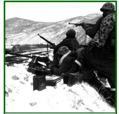
Korean War Chosin Reservoir

Several of our Veterans here at VVH are fellow cold weather warriors. We all know those that fought in the Korean War know the effects of extremely cold weather very well, on both people and equipment in combat, as do many of our WWII European Theater Warriors.