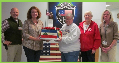
American Legion Auxiliary Unit 50