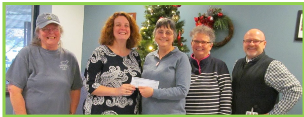
VFW Post 32 Auxiliary