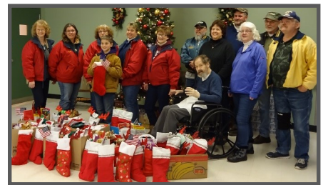
American Legion Unit 49 Auxiliary

Valentine's Day Dance at 1:30 pm in Patriot Hall