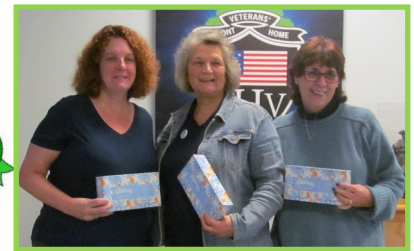
American Legion Auxiliary 67& 36