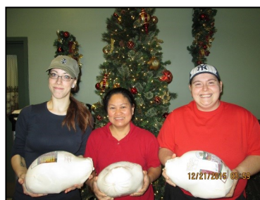
Employees from the Dietary Department receive their turkeys from the Board of Trustees.