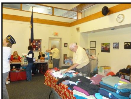
The Veterans' were able to shop for their loved ones with help from the American Legion Auxiliary Gift Program.