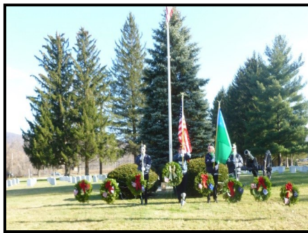
Wreathes Across America is a national organization with over 900 participating locations, focused on remembering, honoring and teaching about fallen soldiers.