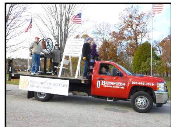
The Chapel Bell - Circa 1885