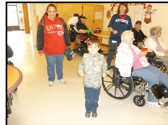
The Home's little soldier visitor.