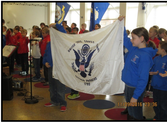
Molly Stark Elementary music program