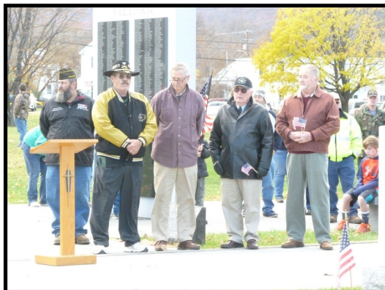
A few members of the Board of Trustees address the visitors at the Home after the parade.