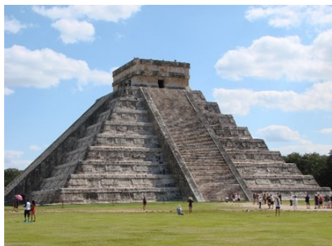
Temple at Chechen Itza

Our week in Cozumel was great. The weather was in the upper 80's all week long with the sun shining all the time. My brother and I went to the mainland on Thursday to visit the Mayan ruins at Chechen Itza and to a sinkhole which I will call the fountain of youth. Chechen Itza is on the mainland of Mexico in the Yucatan Peninsula and is a UNESCO World Heritage Site that was inhabited between 600 – 1300AD. The area encompasses about 5 square miles and there are many buildings on the site. The main pyramid has 4 sides each with 91 steps and then a single step at the top to reach the altar, which totals 365 which is the number of days in the year. What is really interesting is that when you face either the north or west sides of the temple and clap your hands the returning sound is that of the Quetzal bird. For those of you who have internet access, please search for this. It is really amazing and having been there makes it more amazing. There is also the Warrior Temple, which was of interest to me and I think would be to some of you.