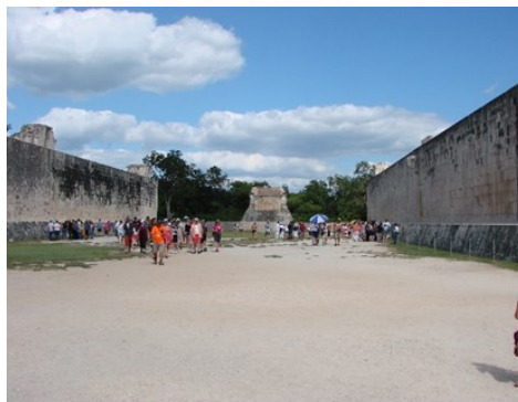
Ball Field at Chechen Itza

Next month I will finish off the vacation with pictures from the hotel, center Cozumel and the sunsets. Just what we need for the new year! I will try not to mention anything about the tequila tasting tours and the many different tequilas there are.