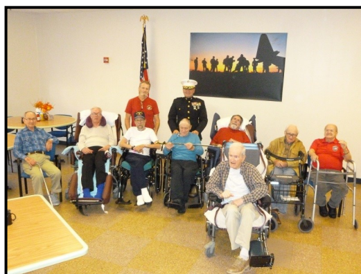
A few of the Home's proud Marines