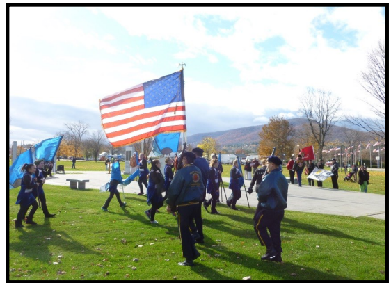
Mount Anthony Union HS Marching Band