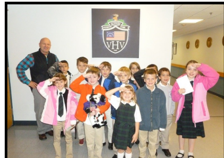
A visit from St. Mary's Academy