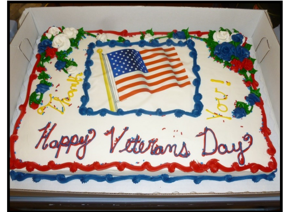
A beautiful cake donation