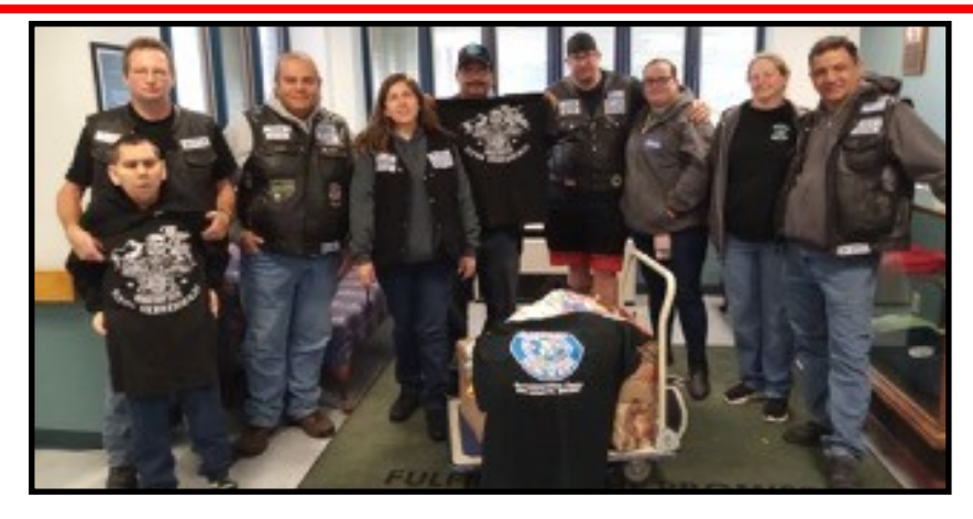
The Boston ROADDOCS of Housatonic, MA donated 100 Tee shirts and casual shirts for our residents.

The various pine cones were actually gathered on the VVH grounds.